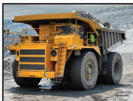
Specialty Trucks, such as Dump Trucks, Garbage Trucks, Concrete Trucks, Utility Trucks